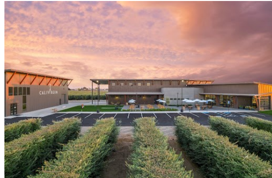
Calivirgin Winery & Olive Mill – Lodi

The Trincherro Westside winery covers 660,000 square feet, nearly the size of four typical Wal-Mart Stores. The plant opened in 2015 with technology that is jaw-dropping. The winery consolidates Trincherro’s bottling and shipping operations, bringing the company’s production to the Lodi-area vineyards where much of the fruit for Trincherro wines originates. The impressive facility showcases equipment from all over the world and features automated warehousing which is nothing less than state of the art. Attendees will learn about the history of Trincherro Family Estates and the development of the Westside plant in Lodi.